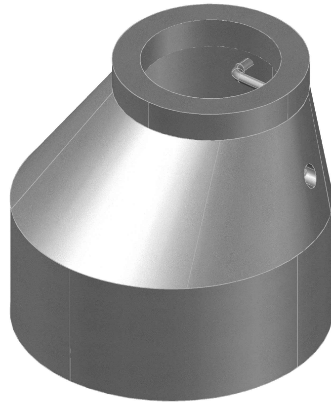
ISOMETRIC VIEW NTS