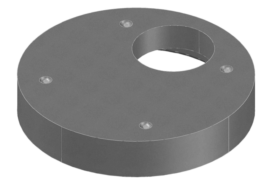
ISOMETRIC VIEW NTS