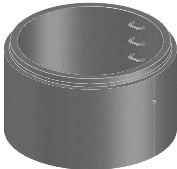
ISOMETRIC VIEW NTS