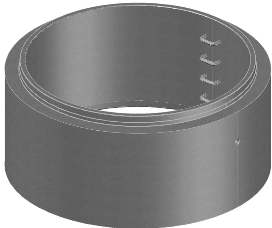
ISOMETRIC VIEW NTS